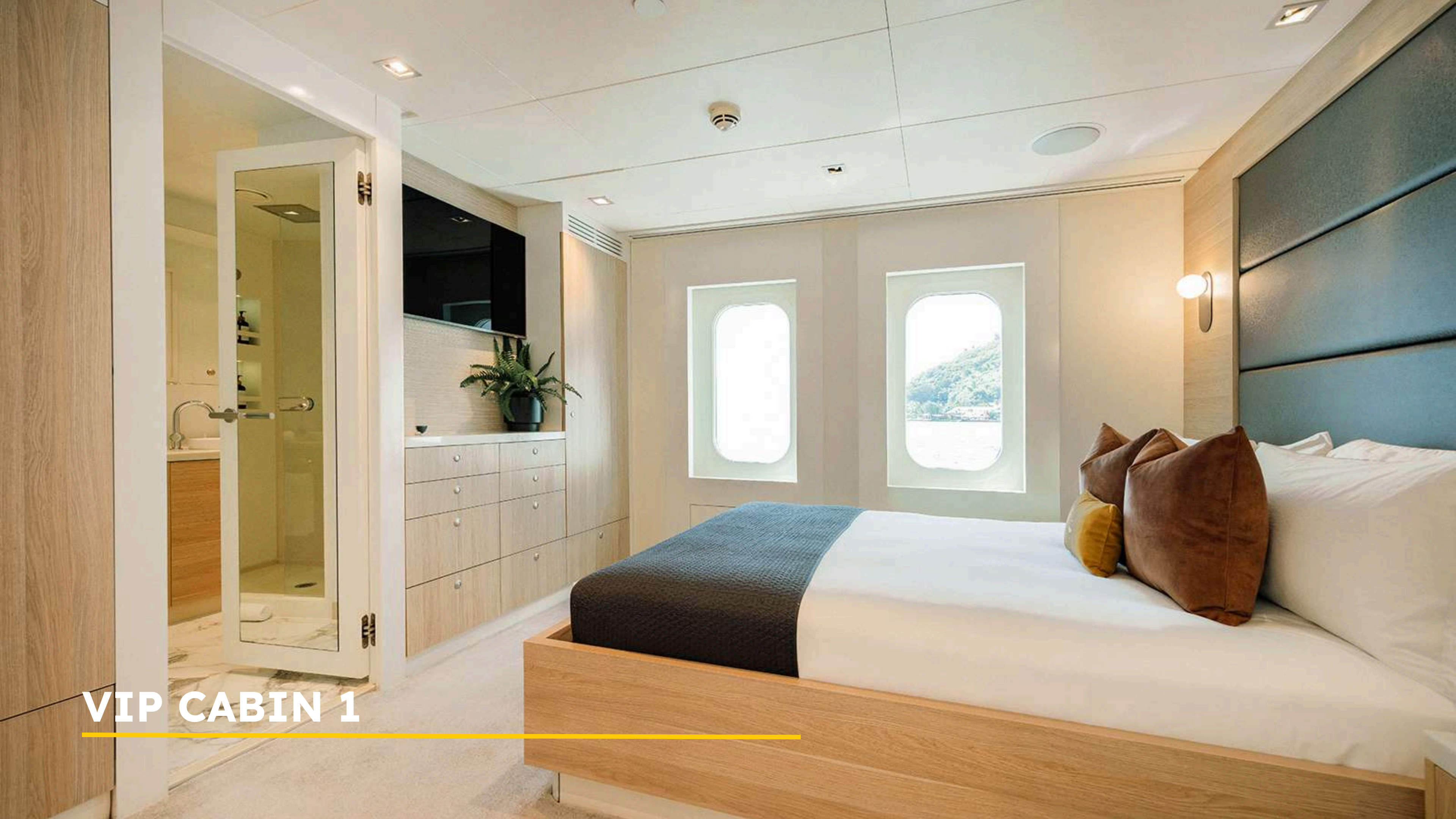
VIP CABIN 1